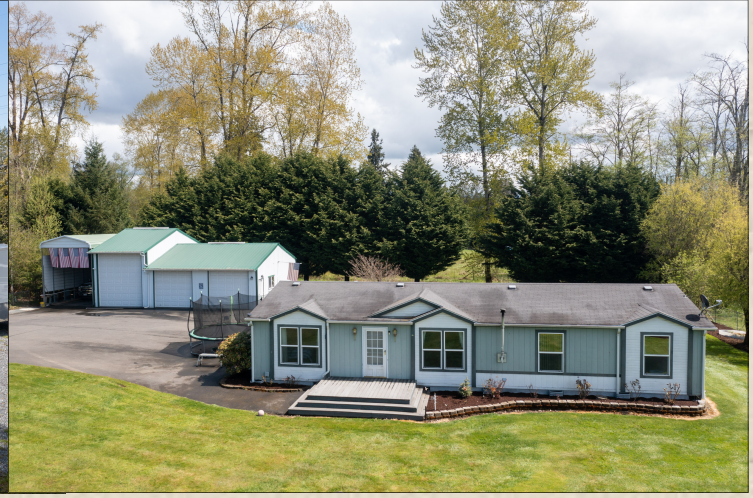
Home, Shop/Garage and tall Boat Carport are on the right in the drone photo, above.