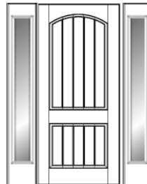
Tuscany & Carrara Plans ONLY